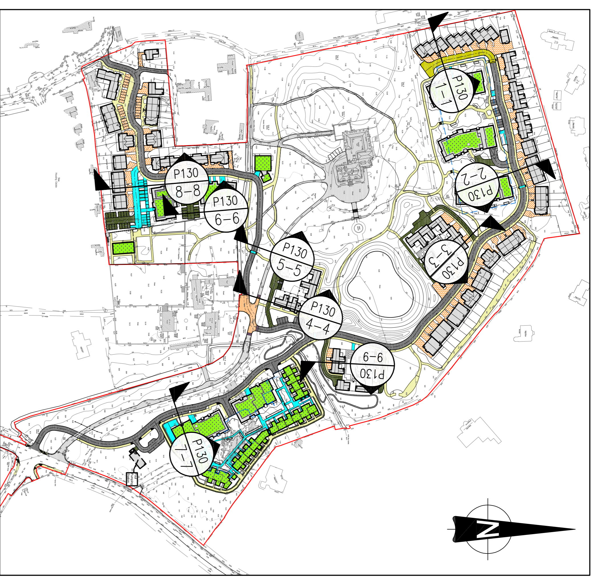
SECTION LOCATION PLAN SCALE 1:2000